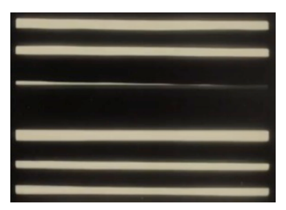
Figure 1. Still from Walter Ruttmann: Opus IV (1925).