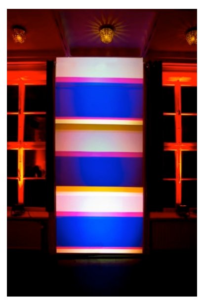
Figure 4. S T R A T I C audiovisual performances.

arise. One example of such, is op (optical) art. Op art employs perception at its best, it explores the visual field of an abstract image and creates an illusionary and imaginary sphere, where the eye receives particular illusions and creates new visual narratives. All of this is a potential space for possible creative approaches, but also an open space with implications for design.