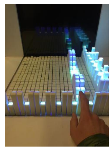
b) A user triggers a sound wave while drum beats also play.