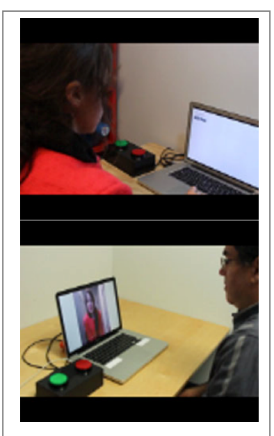
Figure 1. The two participants sit inside two separate rooms and interact with each other via a telecommunication medium, experiencing nine different modes of liveness, as summarized in Table 1.

At the end of each mode, they should answer the question, "Was the other participant interacting with you?" using the arcade buttons, in order to proceed to the next stage.