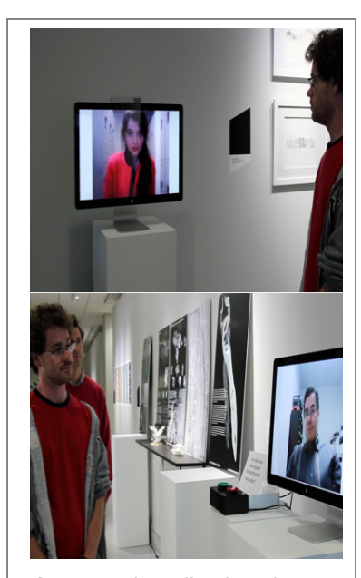
Figure 2. The gallery's audience members are simultaneously viewing the camera feeds of the two participants, streaming live in the main exhibition space.

They are asked to answer the question, "Are these two participants interacting with each other?" using arcade buttons. After pressing a button, they are notified about the percentage of other audience members who have agreed with their response in that stage.