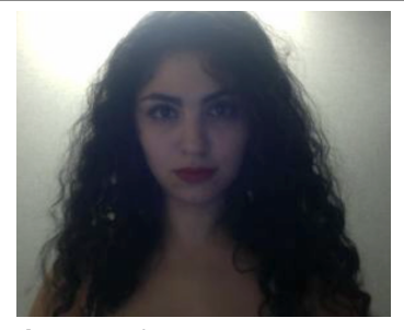
Figure 3. The artist as an actor and super-user