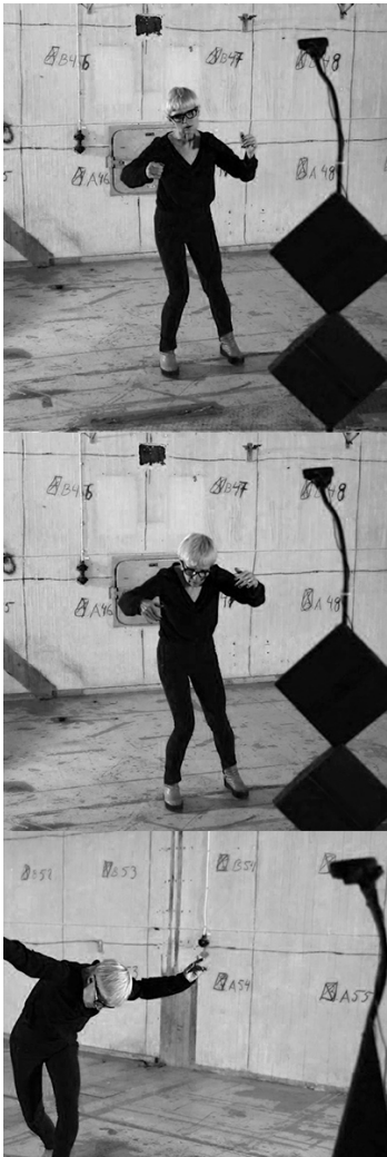
Figure 4: A montage of frames from the video that accompanies this paper.

faster than its nominal playback speed will cause the resulting sound to be higher in pitch. This, however, does no longer have to be the case using the phase vocoder. Here instead, like conducting an orchestra, going faster or slower doesn't mean going out of tune. Being free to move through the musical material at any pace, each layer is given a separate playback position. That position corresponds to the point in the data file from which the synthesizer should take spectral information to create its sound. When the observers detect movement, the playback position of the layer assigned to the observer is pushed forward proportionally to the amount of movement, while the volume of that layer is turned up for the duration of the movement. Currently, the source material is divided into three layers that are assigned to an observer, as per the description above. One layer contains the voice of Maria Callas and the other two contain orchestral accompaniment of two different styles, one more energetic, fast, and loud, the other softer, more pensive, and slow. Some qualities in the synthesis have been fine tuned in the three layers to accommodate the different source material.