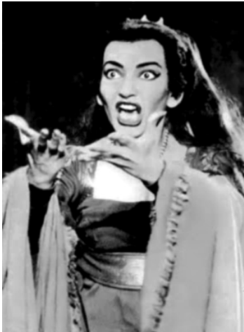
Figure 1: Maria Callas in the role of Medea in Cherubini's opera Medea.