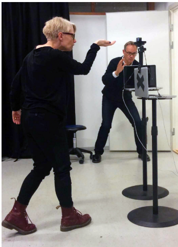
Figure 2: Early experimental setup using laptops on speaker stands.

into sound in real-time. This is achieved by positioning observers in the performance space that view and analyze the movements of the users. An observer is a sculptural presence, movable but not mobile, vaguely anthropomorphic, that is equipped with a digital video camera. The observers analyze what they see, and communicate their results to a central hub, wirelessly, so that a soundscape can be produced. The system can accommodate any number of observers and users. While the current iteration uses three observers, future plans include increasing this number substantially.